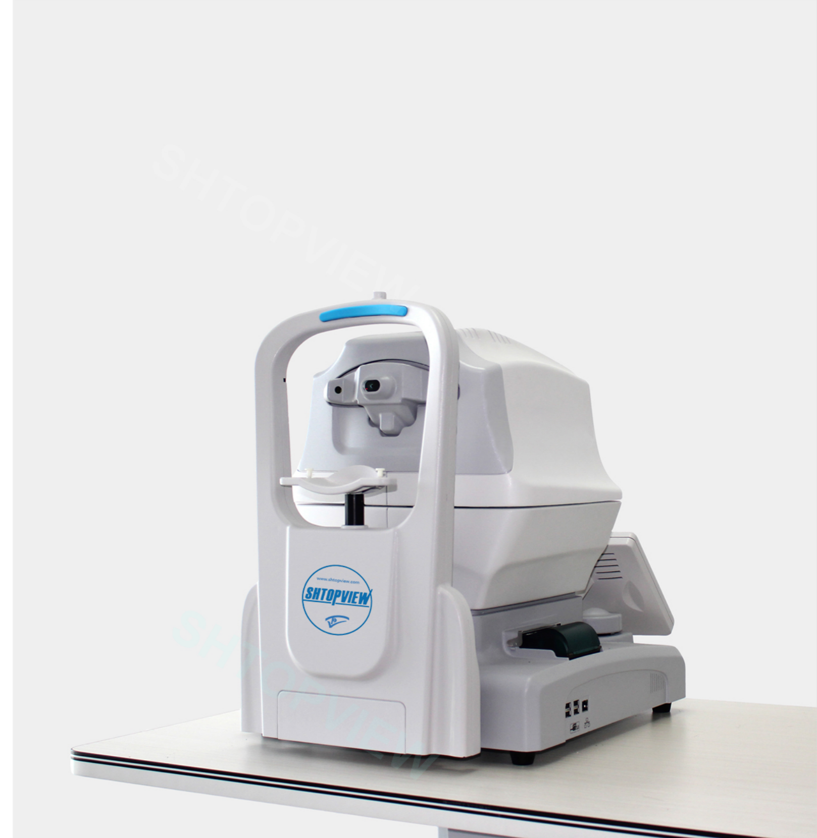
ST-1000 ST-1000P Full Auto Non-contact Tonometer

* Note:with development of technology, specifications and design are subject to change without notice.